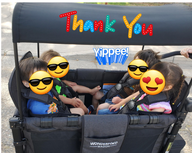
Above: A quad stroller wagon with five-point adjustable safety harnesses purchased for a foster family currently caring for four children under the age of four as part of our Expanding Horizons program.