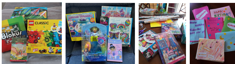
Below: It's Yuur Birthday pictures