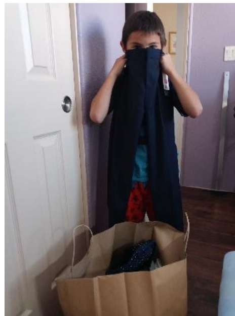
Look who got new clothes thanks to CHK!

period so that we can award more scholarships throughout the year, partnering with Clothes Helping Kids (CHK) on a new program— Style and Fit —which allowed foster children and youth to shop for school clothes of their choosing, and a very generous charity golf tournament benefiting NMFFC hosted by R1 Realty New Mexico .